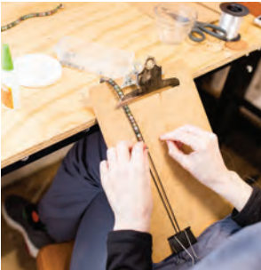
Survivor Leader Making Bracelets

Wings of Refuge hired our first survivor leader in 2019! As a graduate of Wings of Refuge who has experienced new life and freedom, she is passionate about helping other survivors discover their God-given talents and commit to their own restoration. She has provided invaluable perspective and input in programming and was the catalyst for launching the ONE MORE social enterprise.