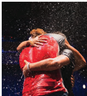
A Survivor Got Baptized

This past year has been full of new life for one survivor in particular. After about a month of being at Wings of Refuge, she gave her life to Christ and got baptized! From there she was reunited with family for the first time in 20 years, began building relationships with safe people, has maintained sobriety milestones, and works at a job she loves. One of her greatest truths relates to Joseph in Genesis 50:20. She will tell you that her trafficker intended to harm her but God used it for good.