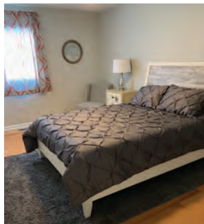
Bedroom in the Wings House

In March, Wings of Refuge moved to a permanent home in Ames! Thanks to your generosity in giving and volunteering, our new house was transformed into a beautiful restoration home that serves five women. Many survivors have stated that they feel a sense of family and safety within just a few days (or hours!) after being welcomed into the home.